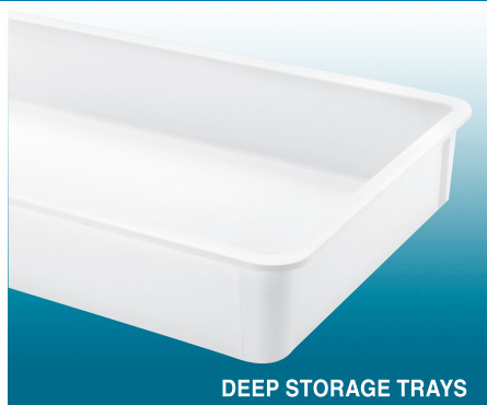
DEEP STORAGE TRAYS